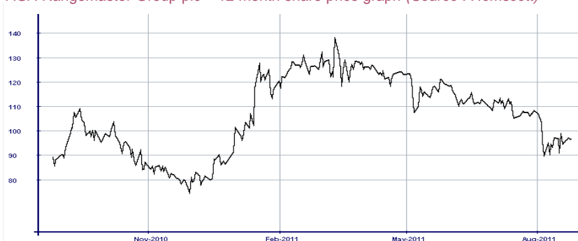
AGA Rangemaster Group plc – 12 month share price graph

* Denotes Chairman of the Board or Committee